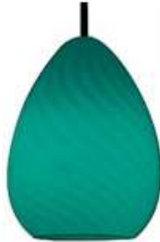
Shown with lights off