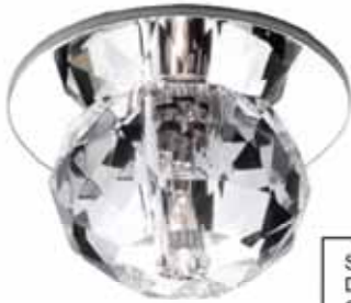
Shown with DR-363 Shade